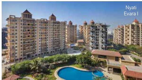
Nyati Evara I