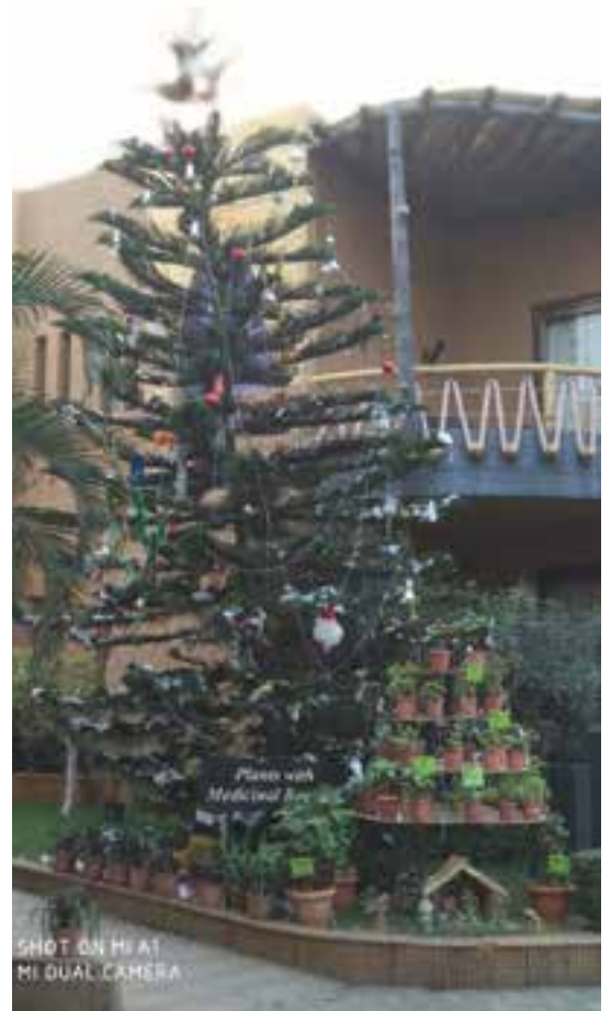
The Corinthians Resort & Club, all dressed up for the festive season with the atmosphere filled with holiday spirit.