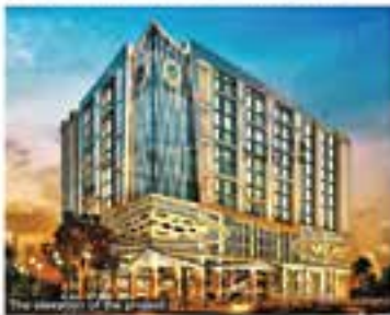
The exterior of the project.