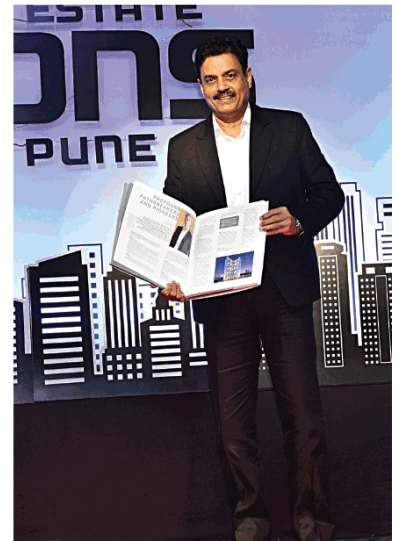
Legendary Cricketer Dilip Vengsarkar unveiled the Coffee Table Book