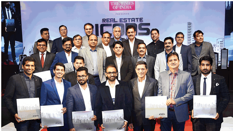
Real estate icons at the unveiling